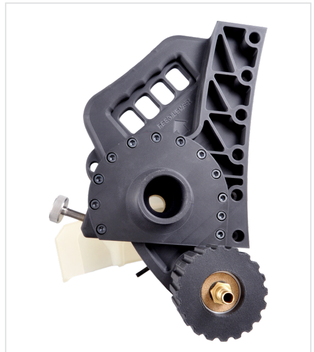
Siemens' circular saw housing was printed in Onyx, a nylon base with chopped carbon fiber, and then reinforced with continuous carbon fiber.