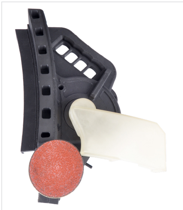
The circular saw housing, which would have taken weeks to be fabricated and assembled, took only a few days.

Once the engineering team had tackled this project, they began to adopt a design for additive manufacturing (DFAM) approach to problem solving. Now, engineers at Siemens Gas & Power first look to 3D printed parts over traditionally fabricated components when needed.